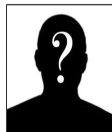
To Be Announced March 7 th